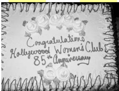
HAPPY 85 TH BIRTHDAY!